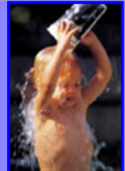
Water is Liquid Life